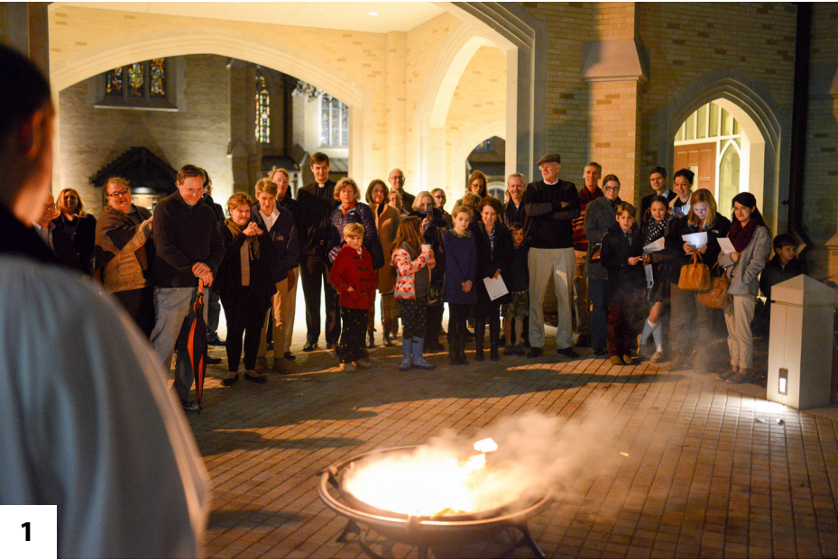
PHOTO RECAP CHURCH OF THE INCARNATION