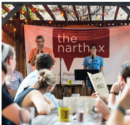
YOUNG ADULTS MINISTRY: THE NARTHEX

We are richly blessed as a church, and it is only right and proper that we give back to those less fortunate. 2016 saw the opening of Incarnation House, an initiative we helped found that provides a place for homeless teens to go after school and a safe environment to help them stay committed to receiving an education they sorely need to lift themselves out of poverty. Our dedicated Mission & Outreach department has both a local and global eye on serving those in deep need, and I asked the Mission & Outreach team to share with me some of the highlights of 2016: