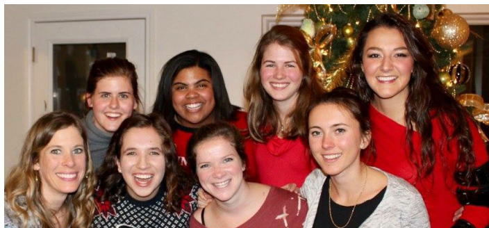
THE 2016 FELLOWS CHRISTMAS PARTY

At Church of the Incarnation, the Uptown Fellows program is a 9-month, Christian Leadership platform for recent college graduates who will: live together in Christian community, pray together daily, work part-time in the field of their choice, study scripture and Christian literature, connect and learn from mentors, and serve the church and surrounding community.