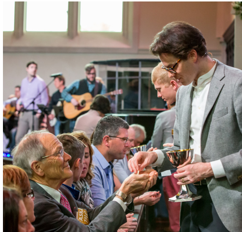
UPTOWN CONTEMPORARY SERVICE

to produce an accessible yet authentic worship experience. Growing from humble beginnings 12 years ago, the Uptown Contemporary Services now see an average weekly attendance across three services of up to 700 people.