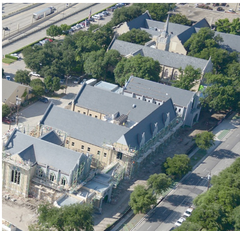
AERIAL VIEW OF NEARLY COMPLETE CONSTRUCTION