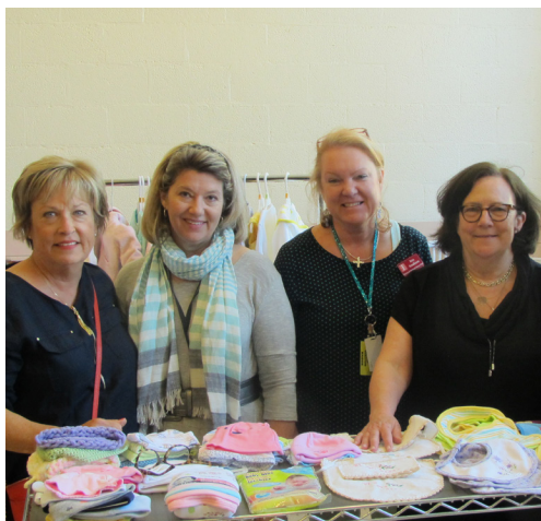
MISSION & OUTREACH: MOMS MENTORING

Incarnation has been richly blessed with talented and committed members and lay and ordained leaders, and has not hesitated to share these blessings with the wider church and the world, as we are called to do. I am very proud of the role this church plays in advancing the Kingdom.