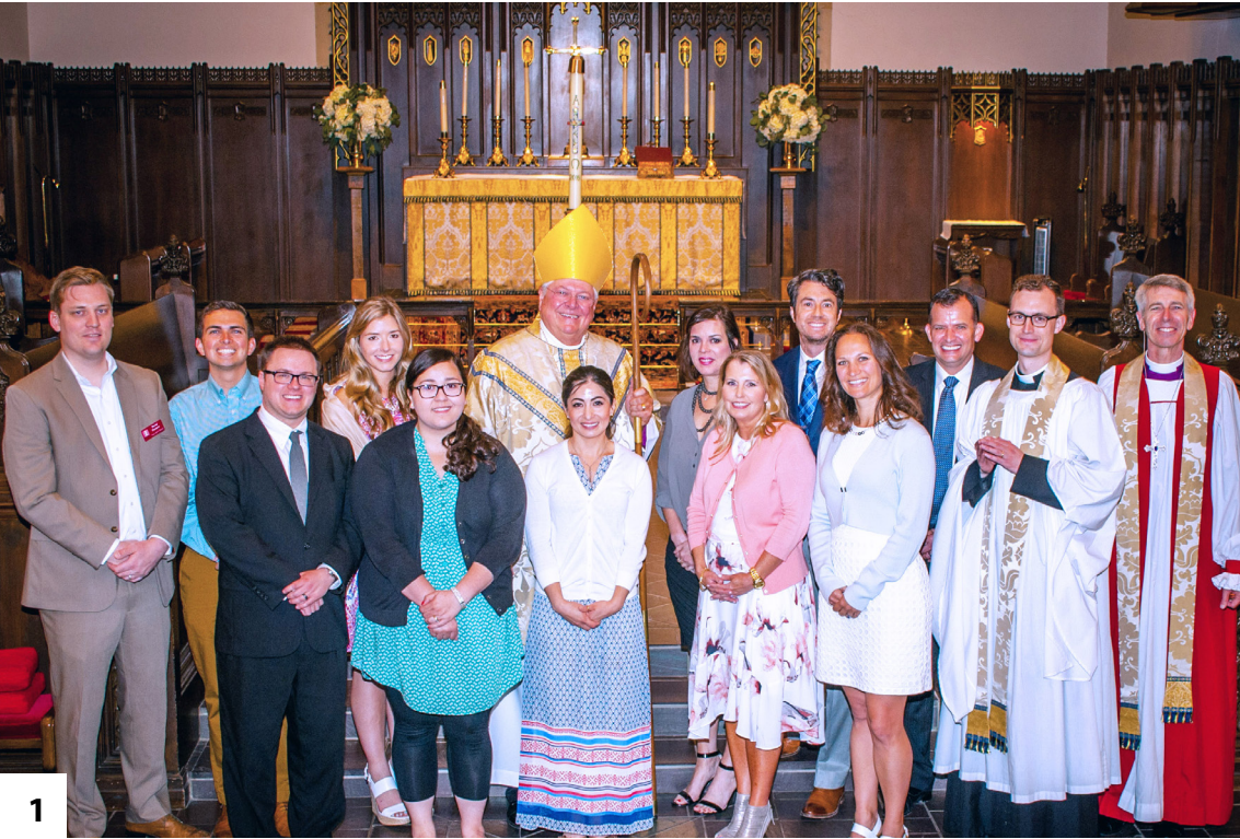
PHOTO RECAP CHURCH OF THE INCARNATION