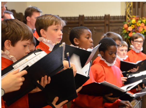
THE CHOIR OF WESTMINSTER ABBEY