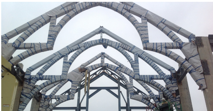
NEW BUILDING CONSTRUCTION