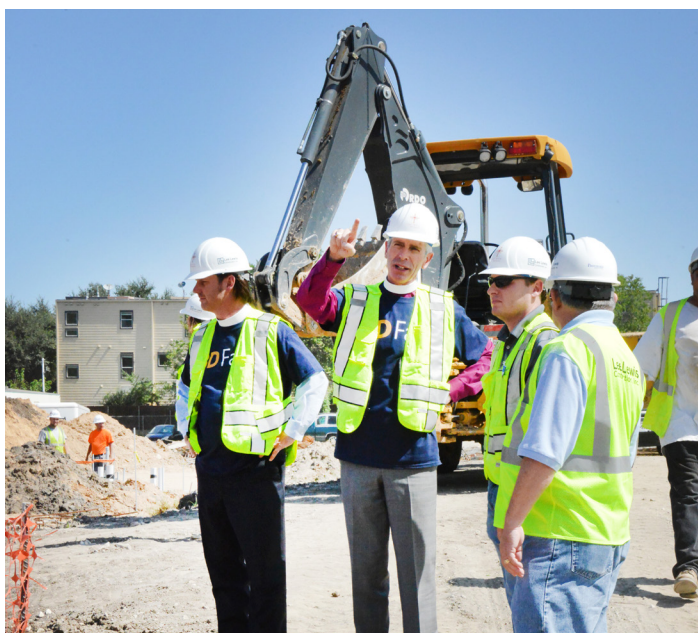
CLERGY AT THE CONSTRUCTION SITE