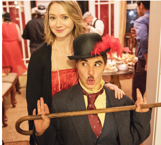
YOUNG ADULTS ROARING TWENTIES PARTY