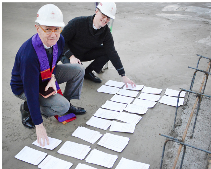
BLESSING OF THE FOUNDATION PRAYERS