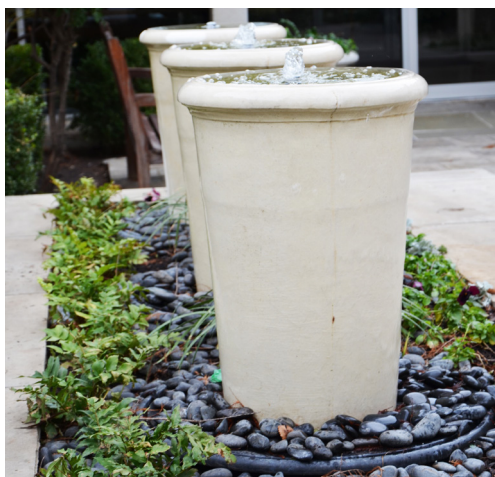
THE NEW BRUTON GARDENS FOUNTAIN

bubbling water. The pots symbolize the Holy Trinity and the soft water sounds provides a beautiful atmosphere for parishioners passing through into the building, stopping for coffee and a visit, or individuals desiring to sit and rest or reflect in this garden area.