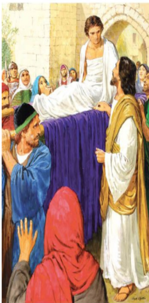
Jesus raises the widow's son to life