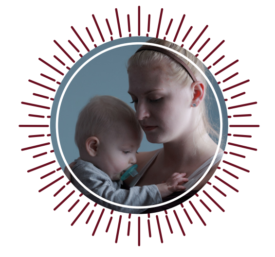
ACT: Donate supplies to a local domestic violence shelter.

God is on the side of the oppressed and abused (Psalm 56). The scriptures clearly express God's desire for a dramatic transformation of society for those who are burdened, marginalized, or unjustly treated. Survivors of domestic violence often flee abuse with nothing more than the clothes on their backs. Traumatized and fearful, they turn to local domestic violence programs for refuge. Most shelters provide survivors everything they need to start over. And that's why shelters need our help. When we are generous, our lives reflect the heart of God.